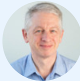
Gilles de Bordeaux CIO Smart Bumper Sticker, Inc.