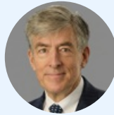
Chris Inglis Former US National Cybersecurity Director, Former Deputy Director National Security Agency NSA